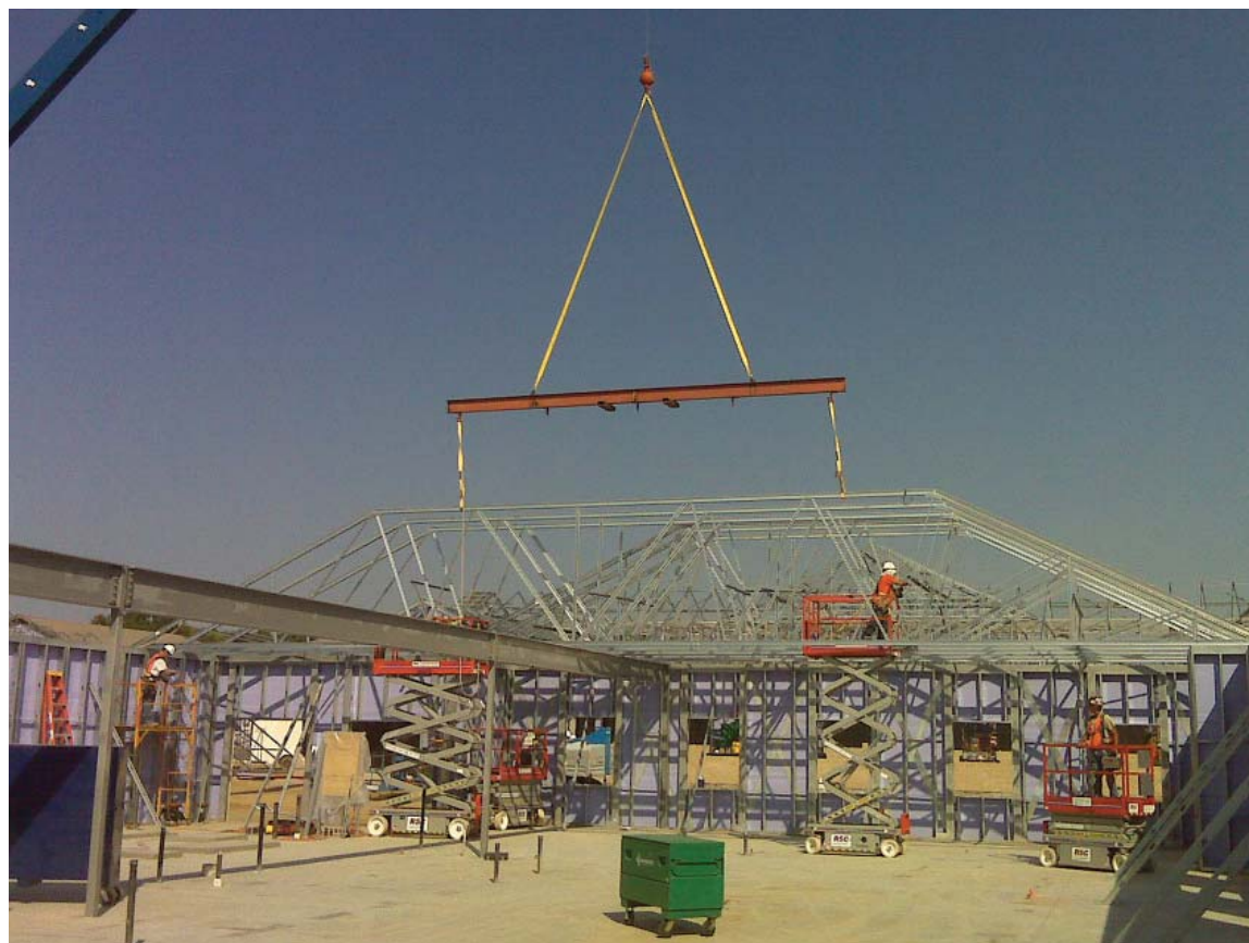
Cranes may lift one truss at a time or a pre-packaged bundle of trusses to the installation point.