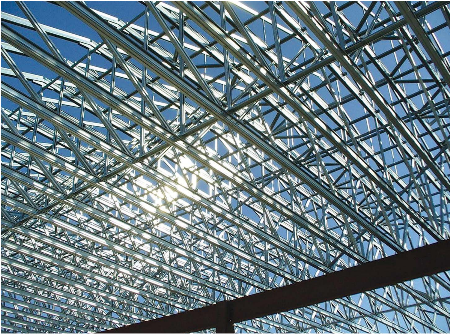
A cold-formed steel truss proved to be a versatile component of the Citizens First Credit Union in Oshkosh, Wis.